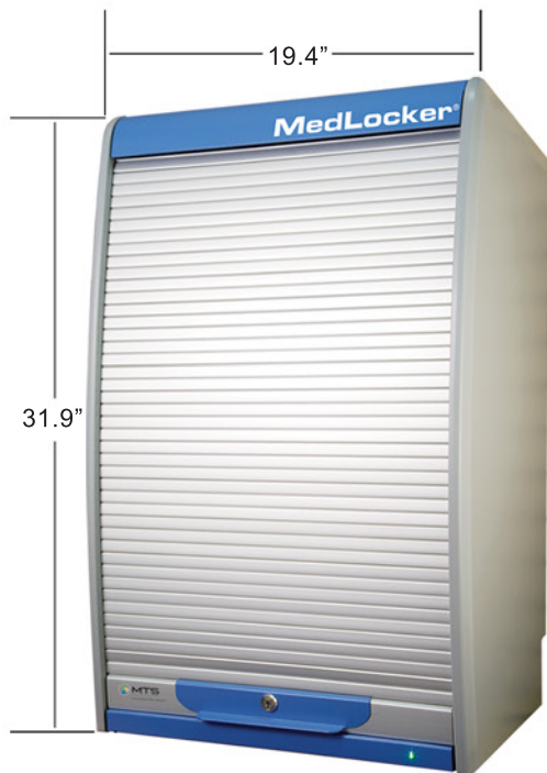
Standard MedLocker Cabinet (96 or 112 slots)